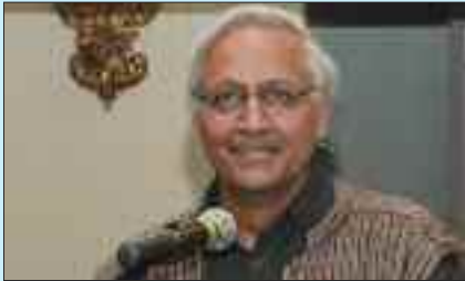
Bunker Roy, Director of the Indian NGO 'Barefoot College', speaking of the success story of a project assigned to the Barefoot College under the Indian Government's Indian Technical and Economic Cooperation Program to help train women in rural areas of African countries to electrify their villages using solar power.