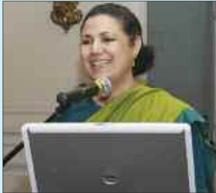
Ambassador Meera Shankar speaking on the occasion.