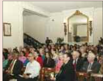
A cross-section of the audience.