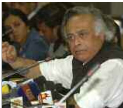
Environment Minister Jairam Ramesh

The Minister said that the 12th Five Year Plan (2012-17) will focus on high growth, inclusive of low carbon emis-