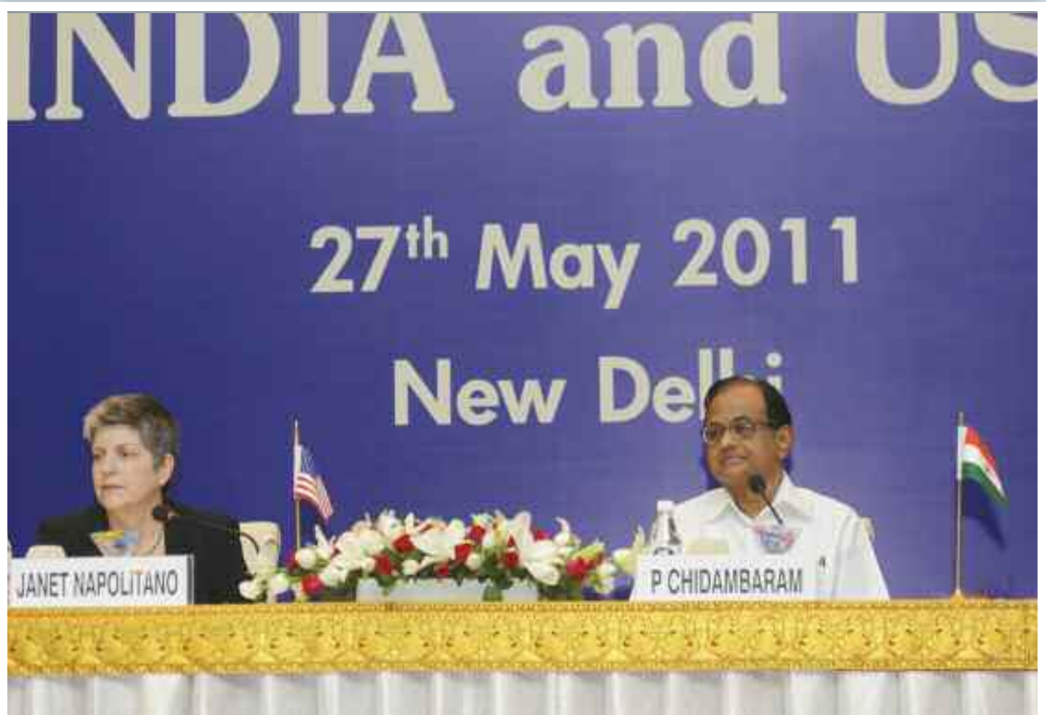
Indian Home Minister P. Chidambaram and U.S. Secretary for Homeland Security Janet Napolitano holding a joint press briefing on the India-U.S. Homeland Security Dialogue, in New Delhi on May 27.