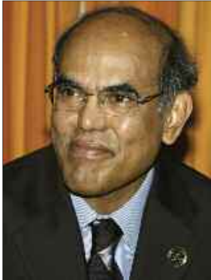
RBI Governor D. Subbarao

"Over the long run, high inflation is inimical to sustained growth as it harms investment by creating uncertainty. Current elevated rates of inflation pose significant risks to future growth," he said.