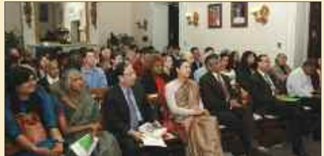
A section of the audience.