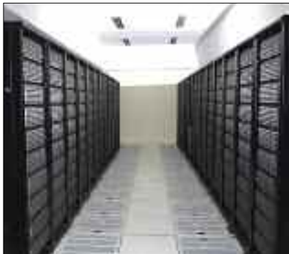
India's supercomputer 'Saga-220'

"The GPU system offers advantage over the conventional CPU (central processing unit)-based