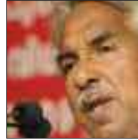
Kerala Chief Minister Oommen Chandy

would be another area where the diaspora can look for possible investments.