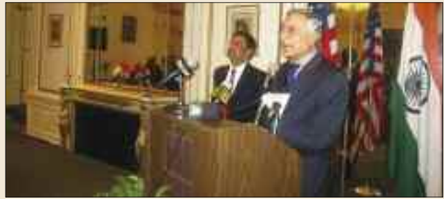
Kanwal Sibal, former Foreign Secretary of India, addressing the gathering.