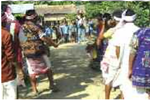
(Above) A homestay at Dhuba Ati village near Kaziranga National Park in Assam; (Left) Villagers welcome tourists in their traditional style; Konyak tribe of Nagaland performing the 'Ao' dance