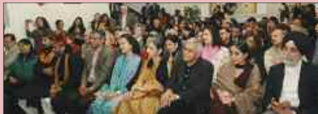
Guests in attendance.