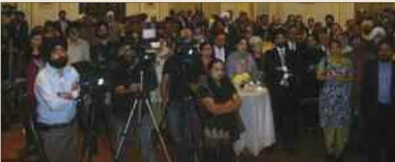
The audience gathered at the Consulate during the Baisakhi celebrations.