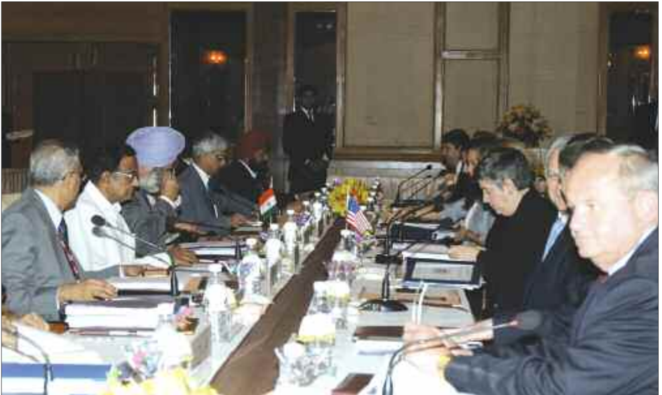
Home Minister P. Chidambaram with U.S. Secretary for Homeland Security Janet Napolitano at a delegation-level meeting, in New Delhi on May 27, 2011.

Both countries affirm the strategic importance of cooperation in tackling terror and other security issues