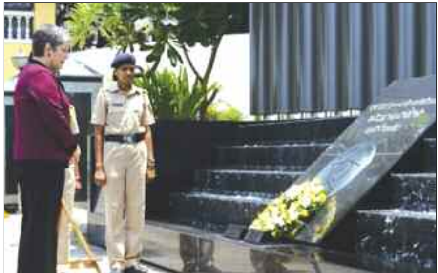
Secretary Janet Napolitano presents a memorial wreath at the Mumbai Police 26/11 Memorial in Mumbai on May 24.

I would propose that our Home Secretary and Deputy Secretary for Homeland Security meet after six