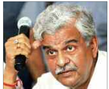
Coal Minister Sriprakash Jaiswal

On e-auctions of coal, he said the ministry had no plan to stop them as those who did not get coal from CIL, got it through this process. On a possible price revision of coal, Jaiswal said it would depend on the wage revision in CIL. "We will do a wage revision before