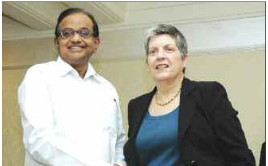
Home Minister P. Chidambaram meeting U.S. Secretary for Homeland Security Janet Napolitano, in New Delhi on May 27.

It implements one of the key strategic outcomes of the visit of President Barack Obama to India in November 2010, during which Prime Minister Dr. Manmohan Singh and President Obama announced the Homeland Security Dialogue. I quote from their Joint Statement: ‘Building upon the Counter Terrorism Initiative signed in July 2010, the two leaders announced a new Homeland Security Dialogue between the Ministry of Home Affairs and the Department of Homeland