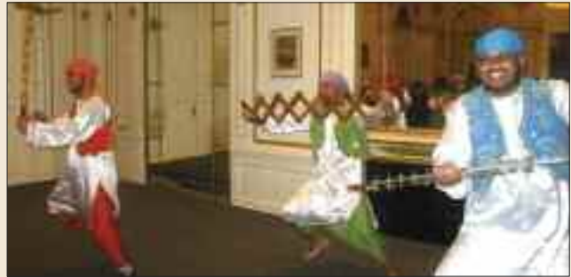
Artistes performing at the event.