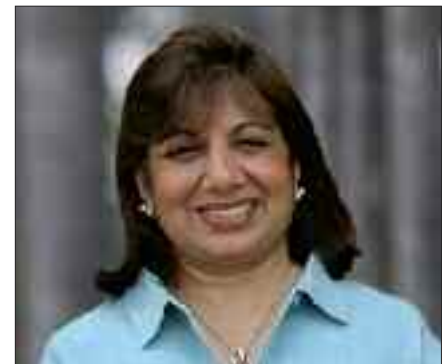
Biocon Chairperson Kiran Mazumdar-Shaw

Referring to the unique positioning of Bangalore, Karnataka Biotech Vision Group and Biocon Chairperson Kiran Mazumdar-Shaw said, "Bangalore has emerged as an innovative hub of India. Sustainable