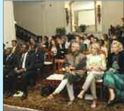
Guests in attendance.