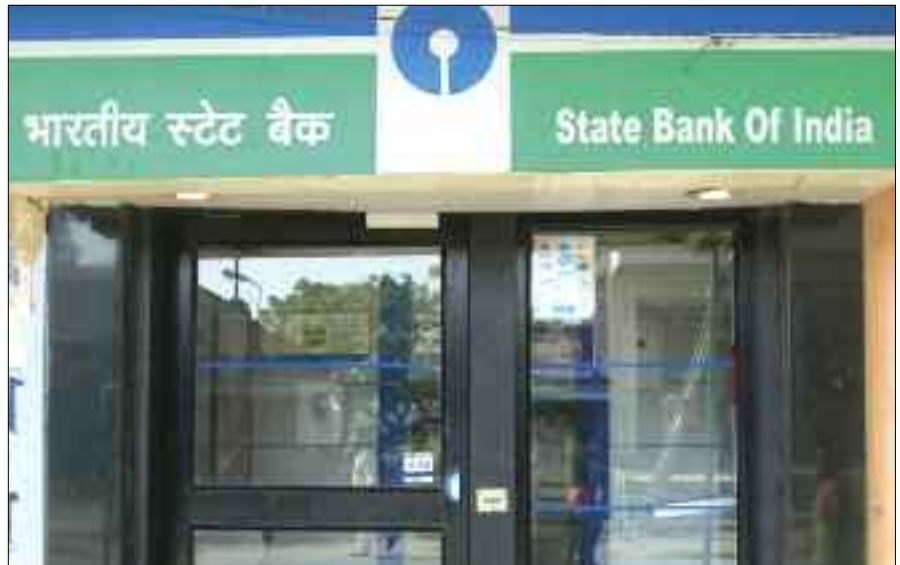
State Bank of India climbed two spots to rank 34th at the Brand Finance® Global Banking 500, an annual international ranking conducted by UK-based Brand Finance Plc.

With respect to gross bank credit also, nationalized banks hold the highest share of 50.9 percent in the total bank credit, with SBI and its associates at 23.1 percent and New private sector