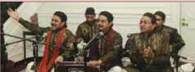
A Sufi music performance by Shahi Qawwals from Ajmer Sharif.