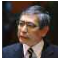
ADB President Haruhiko Kuroda

These seven economies, which in 2010 had a combined gross domestic product (GDP) of $14.2 trillion, or 87 percent of all Asian countries, will also see their share rise further to 90 percent by 2050.