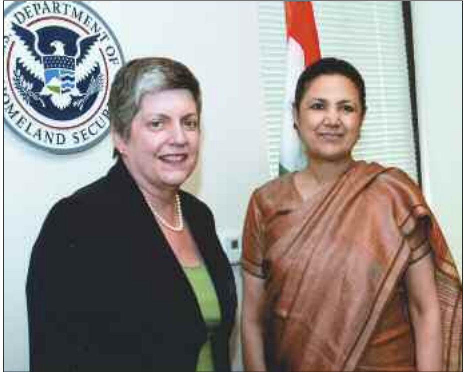
Ambassador Meera Shankar (R) with U.S. Secretary for Homeland Security Janet Napolitano (L).

Later, Secretary Napolitano held talks with Home Minister P. Chidambaram on May 27 in Delhi. The discussions focussed on bilateral cooperation in Counter Terrorism with special focus on Capacity Building, Technology and Equipment, Mega-City Policing, Terrorist Financing, and Cyber Security.