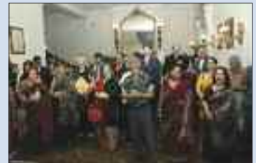
A section of the guests.