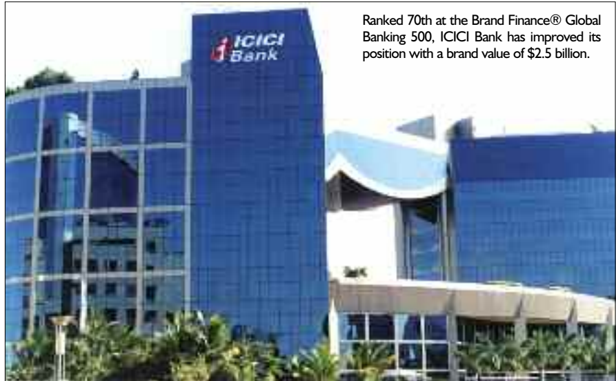
Ranked 70th at the Brand Finance® Global Banking 500, ICICI Bank has improved its position with a brand value of $2.5 billion.

He has also allowed fund houses to tap foreign nationals for investing in equity schemes. "To liberalize the portfolio investment route, it has been decided to permit SEBI-registered