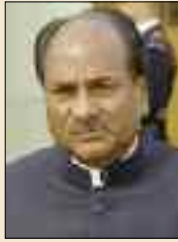
Defense Minister A.K. Antony

The new submarine program, known as Project 75I, will be a follow-on to the six Scorpene-class submarines that are being built at the Mumbai-based Mazagon Docks Limited (MDL) under Project 75. "The government has already cleared Project 75I. At the moment,