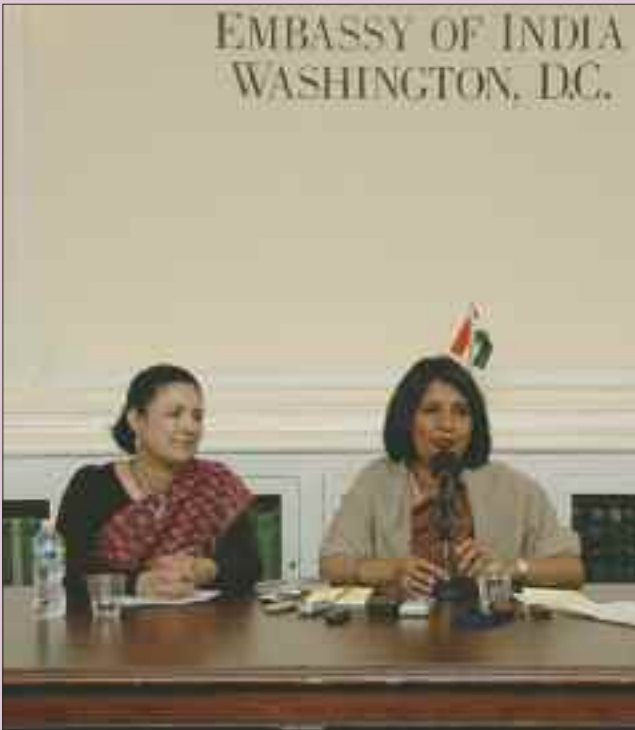
Foreign Secretary Nirupama Rao (right) addressing a press conference at the Embassy of India in Washington, DC on February 15. Also seen in the picture is Ambassador Meera Shankar.