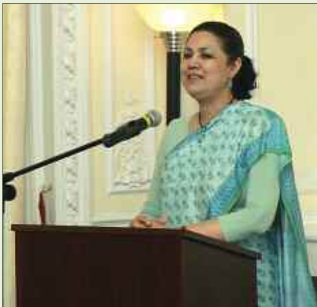
Ambassador Meera Shankar addressing members of the National Council of International Visitors at the Embassy on February 18.