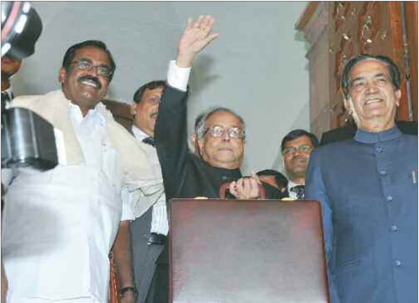
Finance Minister Pranab Mukherjee arrives in Parliament House to present the General Budget 2011-12, in New Delhi on February 28, 2011. Ministers of State of Finance S.S. Palanimanickam (left) and Namo Narain Meena (right) are also seen.

Finance Minister allows registered mutual funds to accept money from foreign investors and hikes the cap on investments in infrastructure bonds