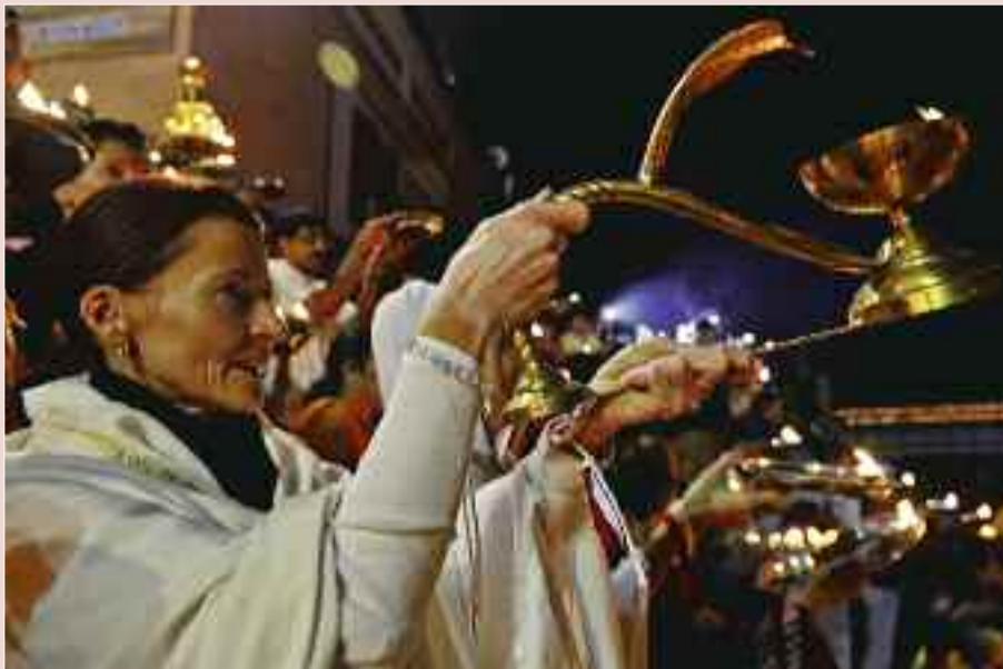
Devotees conduct a traditional 'aarti' on the occasion of Maha Shivaratri on March 3, 2011. The festival is marked by special prayers and a day-long fast offered to invoke Lord Shiva.