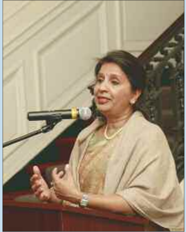
Foreign Secretary Nirupama Rao briefing the students on 'India's Foreign Policy' at the Embassy on February 13.