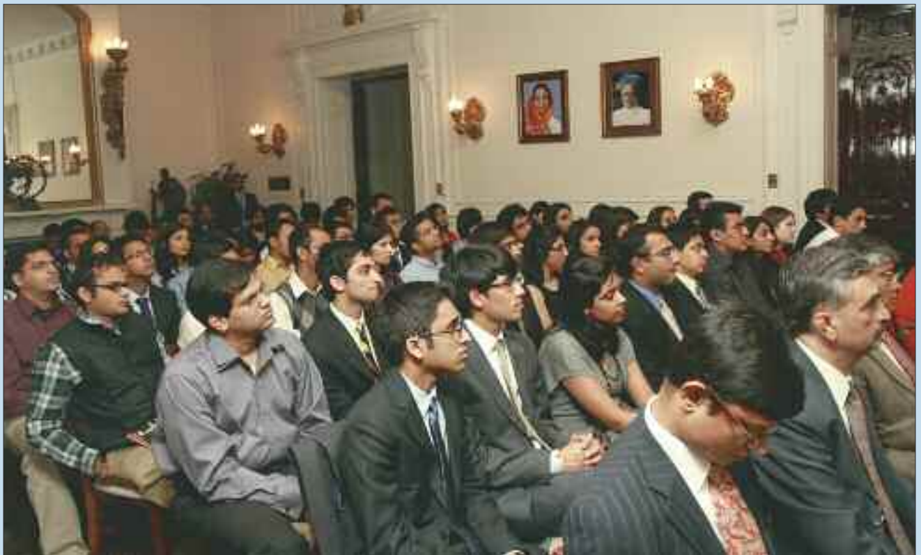
A section of the audience.