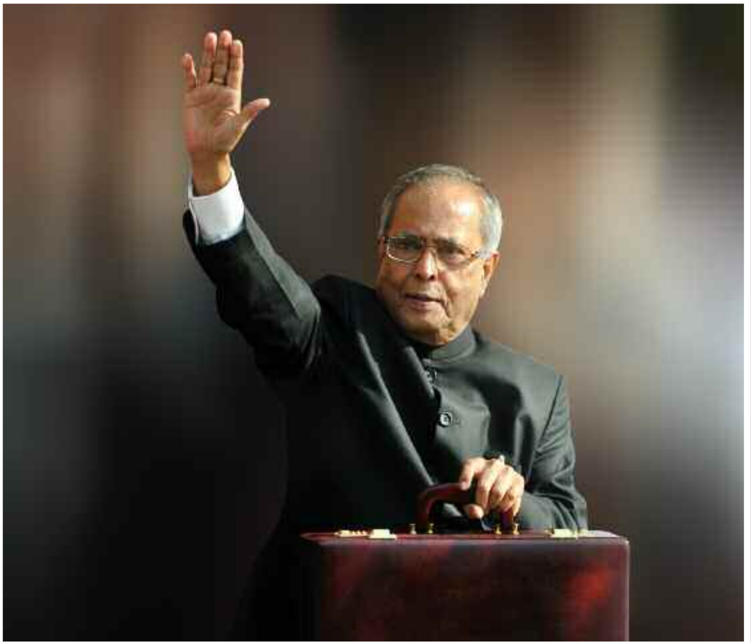
Finance Minister Pranab Mukherjee arrives in Parliament House to present the General Budget 2011-12, in New Delhi on February 28, 2011.