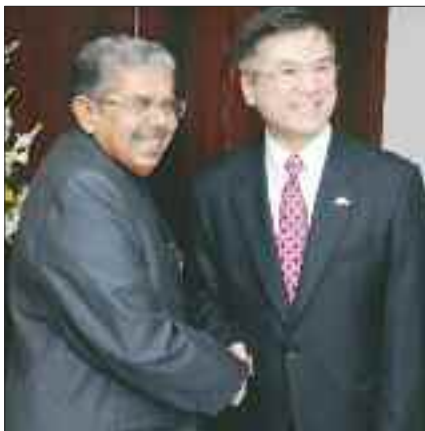
Minister for Overseas Indian Affairs and Civil Aviation Vayalar Ravi meeting U.S. Secretary of Commerce Gary Locke in New Delhi on February 7, 2011.

The ACP bilateral partnership which was launched in 2007, targets mutual interests in supporting modernization requirements of India's rapidly growing aviation sector. The United States Trade and Development Agency is the lead sponsor of the ACP and funds technical assistance programs for the Directorate General of Civil Aviation (DGCA) and Airports Authority of India (AAI). Minister Ravi thanked Locke for the projects already under way which have helped the Indian civil aviation sector on the whole. Both