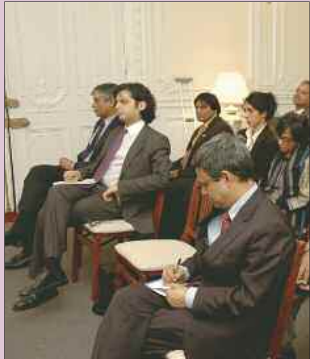
A section of the audience.