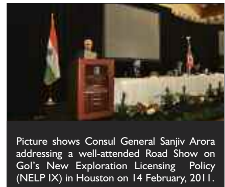
Picture shows Consul General Sanjiv Arora addressing a well-attended Road Show on Govt's New Exploration Licensing Policy (NELP IX) in Houston on 14 February, 2011.