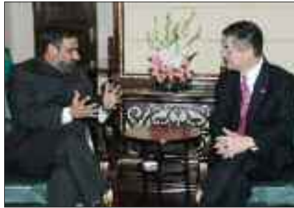
Secretary Gary Locke with Minister Anand Sharma in New Delhi on February 7.

In their discussions, the two leaders focussed on deepening mutually beneficial trade, providing win-win opportunities for both countries. Secretary Locke and Minister Sharma had earlier met during President Barack Obama's November 2010 visit to India. "The US-India bilateral relationship is stronger than ever before, and President Obama's recent visit highlights the priority this administration places on this relationship," Locke