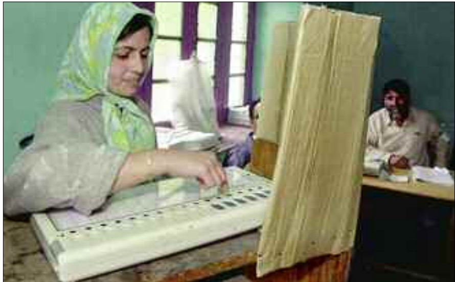
File photo of a woman casting her vote using the Electronic Voting Machine at a polling station in Sheeri, near Srinagar, India, in 2004.

It said that Indian nationals, not residing in India, will be entitled to have their names registered in the electoral rolls in the Assembly or parliamentary constituency in which their