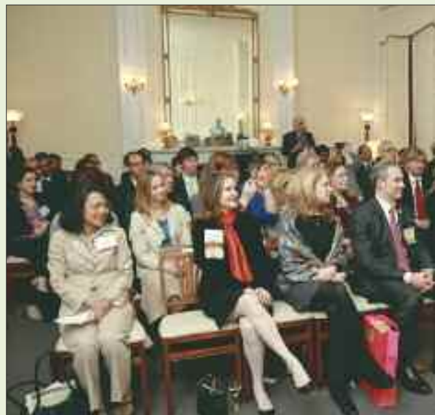
Guests in attendance.