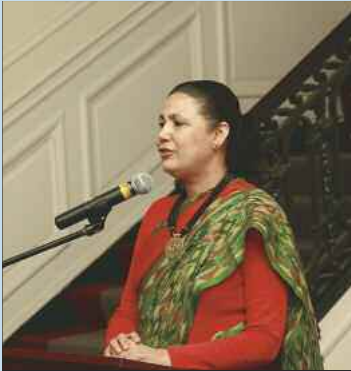
Ambassador Meera Shankar addressing students from universities in the Greater Washington, DC area, at the Embassy on February 13.