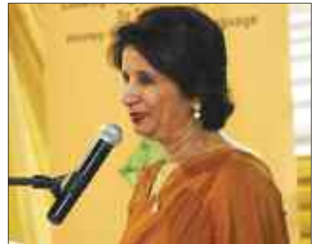
Ambassador Nirupama Rao addressing leaders of the Indian-American community at Global Mall in Atlanta on March 3.

I am also really happy to see the initiatives that Emory has taken to strengthen its ties with India, through its various programs whose numbers continue to rise, and also by its linkages with Indian institutions. The impact of these initiatives is not limited to the immediate academic field but more importantly they help foster a better understanding and create bonds of friendship between the Indian and American peoples.