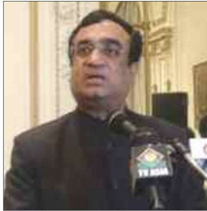
India's Minister of State for Sports & Youth Affairs Ajay Maken

Speaking on the occasion, former Indian tennis star Vijay Amritraj hailed