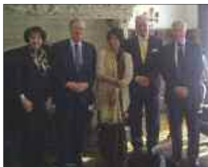
Ambassador Nirupama Rao with a PSAG delegation of the Trade Policy Forum on February 23.

The delegation briefed the Ambassador about PSAG’s activities and the follow-up action taken on its last report submitted to the Trade Policy Forum (TPF) leadership in January 2011. The delegation also shared its thoughts with Ambassador Rao on propelling India-U.S. bilateral trade and economic engagement to the next level. In her remarks, Ambassador