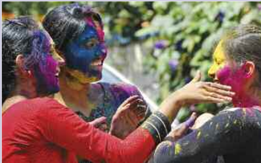
Youth in Bangalore putting gulal (colored powder) on each other as they celebrate Holi on March 8. The festival of colors marks the onset of spring across India.