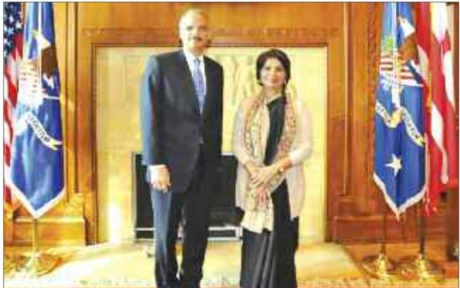
Ambassador Nirupama Rao with the U.S. Attorney General Eric H. Holder Jr. at the U.S. Department of Justice in Washington D.C. on February 21.

Attorney-General Holder and Ambassador Rao discussed the growing India-U.S. cooperation in diverse fields, including counter-terrorism and mutual legal assistance in crime-related matters. Emphasizing the importance of cooperation in the investigations into the Mumbai terror attacks, Ambassador Rao expressed hope that the U.S. would extend cooperation in a few critical areas where India had requested help. This would help investigators bring the main culprits to book without delay, Ambassador Rao said.