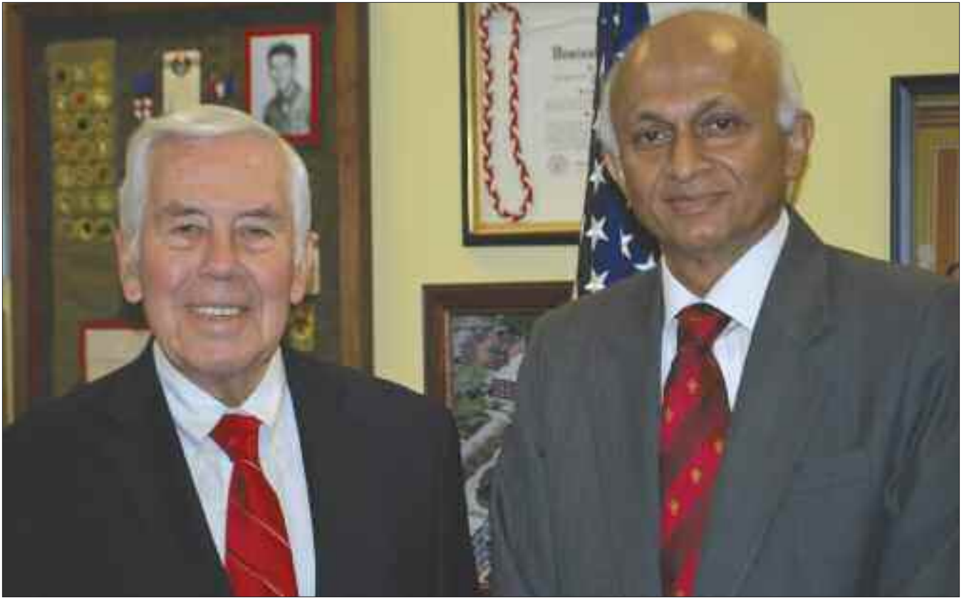
Foreign Secretary Mathai at his meeting with Senator Richard Lugar, Ranking Member, Senate Foreign Relations Committee, on February 8.