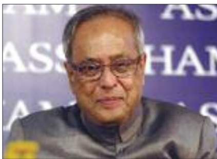
Finance Minister Pranab Mukherjee

the policy will lead to reduction in crime, improvement in public health and uplift of the social milieu," the Finance Minister said.