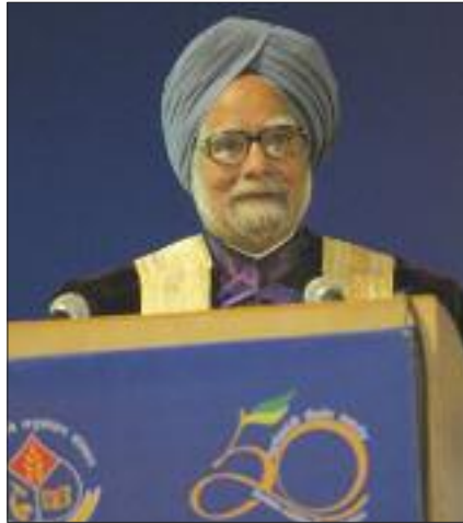
Prime Minister Dr. Manmohan Singh addressing the golden jubilee celebrations of IARI.

The Prime Minister said the Government's flagship agricultural plans like Bharat Nirman, Mahatma Gandhi National Rural Employment Guarantee Act, the Rashtriya Krishi