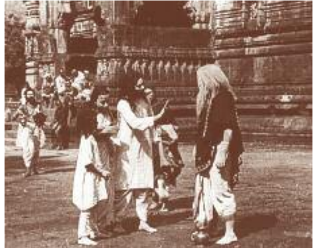
Dadasaheb Phalke. (R) A still from Raja Harishchandra , India's first silent film released in 1913.

Mardan (1919). However, he was unable to cope with the competition posed by the 'talkies', and found few takers for his later films. This compelled him to make his last silent movie Setubandhan (1932) with dubbed voices. Later, in 1937, he attempted his last movie, Gangavatara , before giving up and retiring to his home district. He passed away there on