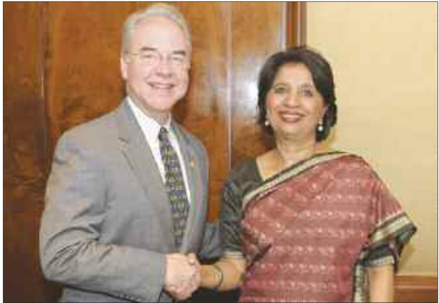
Ambassador Rao with Congressman Tom Price after a luncheon meeting in Atlanta.

In the evening, the Indian-American community, represented by over 80 organizations in Greater Atlanta, held a well-attended welcome banquet in the honor of the Ambassador.