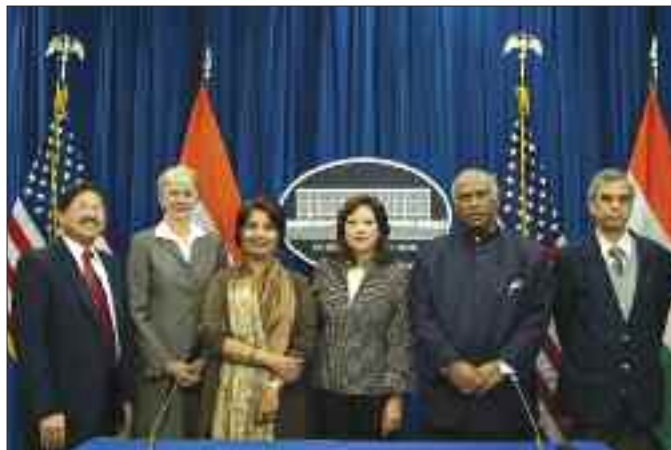
(Above) Labor Minister Mallikarjun Kharge and U.S. Labor Secretary Hilda Solis signing an India-U.S. bilateral Memorandum of Understanding in Washington D.C. on February 2. (L) Minister Kharge with Labor Secretary Solis. Ambassador Nirupama Rao and other delegation members are also seen.

the American experience in providing vocational guidance for unemployed youth and rehabilitating the differently abled, the Minister pointed out.