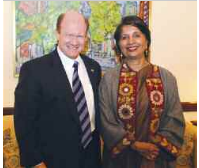
Ambassador Nirupama Rao with Senator Chris Coons at Capitol Hill in Washington, D.C. on February 13.

Naming India as one of “America’s most important partners”, he welcomed the deepening of the India-U.S. strategic partnership.