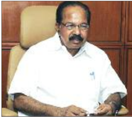
Corporate Affairs Minister M. Veerappa Moily

posed policy would also help bring down foodgrain prices substantially. “Without affecting the productivity of a company, the prices can be brought down. The Competition Policy is not a one-time thing or a one-slot thing, it has a lot of cascading effect. Therefore, seen in the larger context, the prices of foodgrains, for example, will come down appreciably,” Moily said.