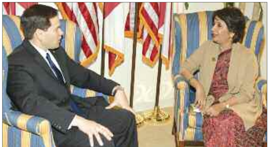
Ambassador Nirupama Rao with Senator Marco Rubio at Capitol Hill in Washington, D.C. on February 14.

Senator Rubio, who is a member of the Senate Foreign Relations Committee, described the India-U.S. relationship as an “extremely important one based on shared values and