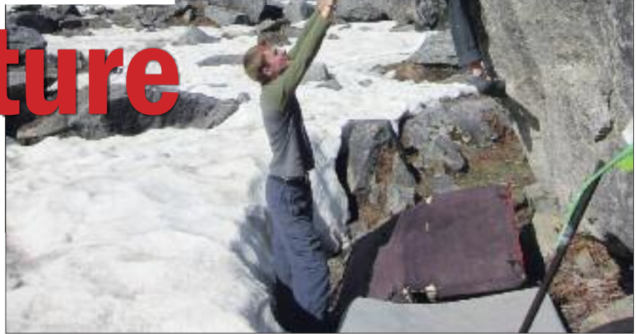
(Left) Snow scooters at Solang; (Right) Foreign tourists trying their hand at rock climbing in the valley.

Although a new sport for most of them, youngsters in Solang are taking to skiing as ducks take to water. Enthusiastic bunch of boys keenly