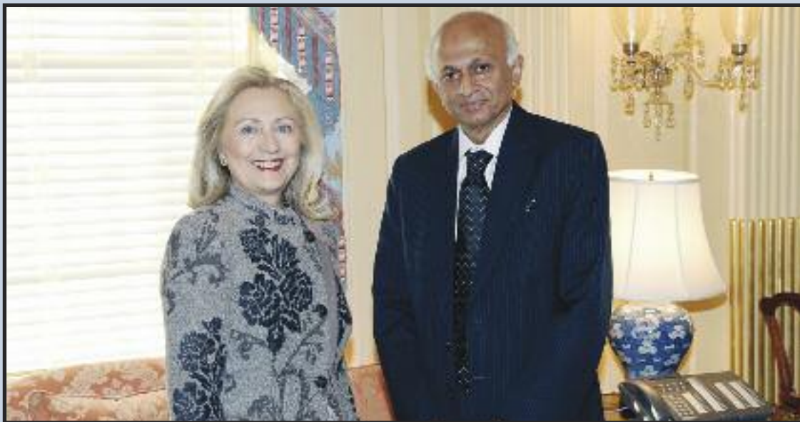
(Top) India's Labor & Employment Minister Mallikarjun Kharge with U.S. Labor Secretary Hilda Solis after signing an India-U.S. Memorandum of Understanding in Washington D.C. on February 2. (Above) India's Foreign Secretary Ranjan Mathai with U.S. Secretary of State Hillary Rodham Clinton in Washington D.C. on February 7.