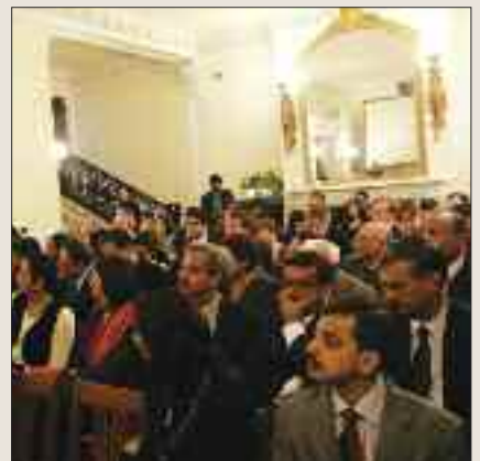
A cross-section of the guests in attendance at the 'HomeSpun' event.