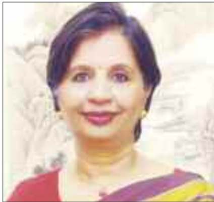
Ambassador Nirupama Rao

At Harvard, Ambassador Rao addressed the Kennedy School of Government on the 'people-centric' dimension of the India-U.S. Partnership and how this "extraordinary people-to-people connectivity was helping the India-U.S. Global Strategic Partnership to grow from strength to strength". Ambassador Rao also addressed the Middle East Seminar on India's foreign policy and interests in West Asia and the Gulf region, jointly organized by the